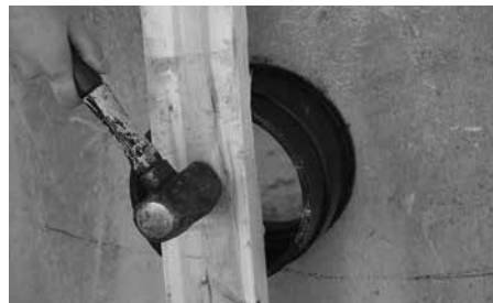
5. Use a flat block of wood and hammer to knock and seat the EZ-Bell Adapter Coupling into place.