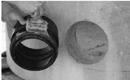
4. Lubricate the gasket of the EZ-Bell Adapter Coupling.