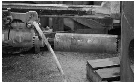
2. Drill/Core manhole.