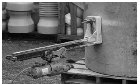
1. Mount saw to manhole.