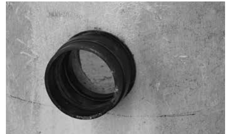
6. Installed EZ-Bell Adapter Coupling ready for service.