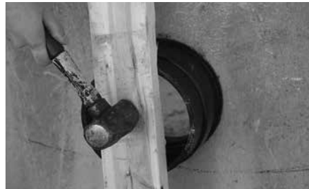
5. Use a flat block of wood and hammer to knock and seat the EZ-Bell Adapter Coupling into place.