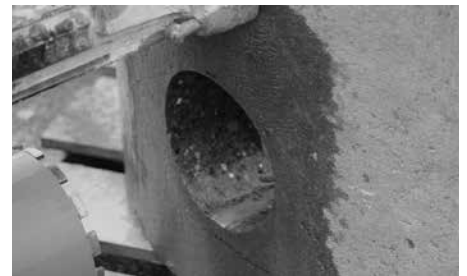
3. Finished hole.